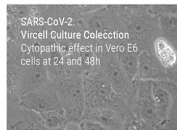
SARS-CoV-2. Vircell Culture Colección Cytopathic effect in Vero E6 cells at 24 and 48h