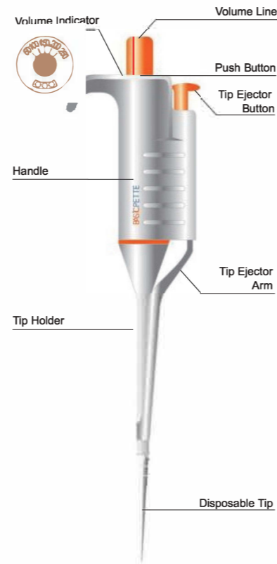
Figure 1 (ABT-BPA-250 shown)